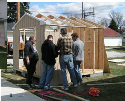
Race for Grace Fundraiser